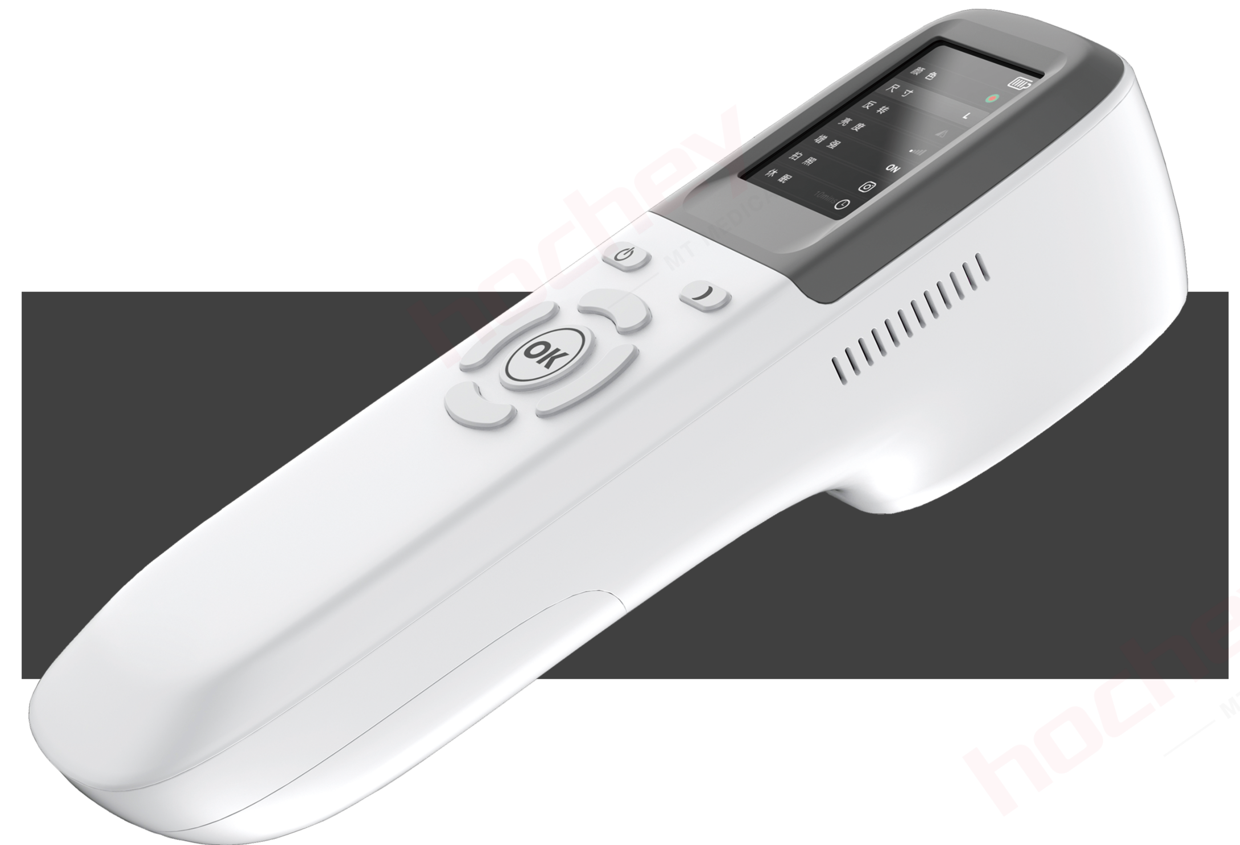
■ QV-600 Vein Finder